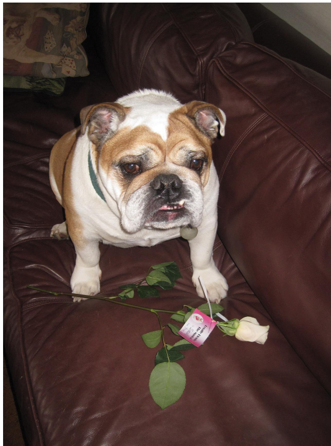
My sister bought me a rose at the performance. How sweet!