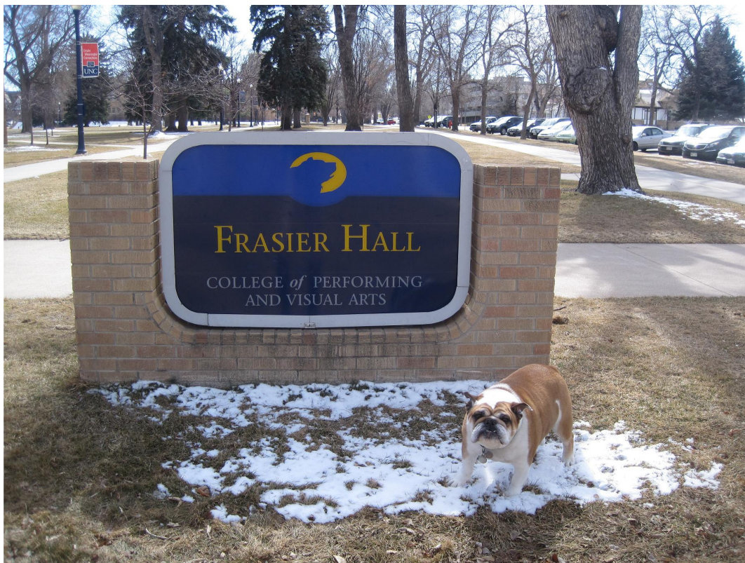
On my way to a matinee performance