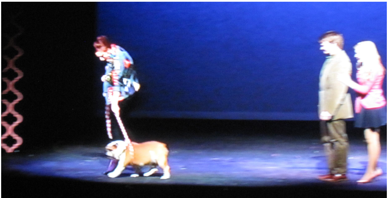
My exit stage right. I didn't flub a line during any performance!